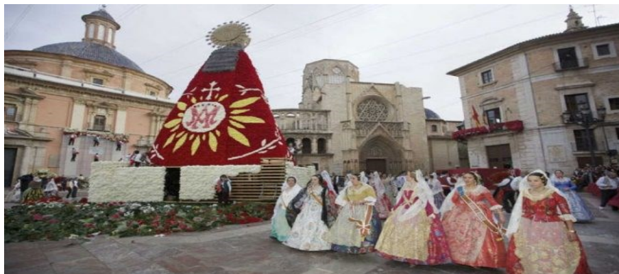
A huge effigies made of various flowers of “La Virgen de las Flores “ in Valencia Spain during the flower festival.

A number of traditions link the month of May to Mary. King Alfonso-X of Castille (Spain) in the thirteenth century wrote in his Cantigas de Santa Maria about the special honoring of Mary during specific dates in May. Eventually, the entire month was filled with special observances and devotions to Mary including placing a crown of flowers. Emperor Ferdinand (The Husband of Empress Isabela of Castille) would remember his diseased wife’s devotion to the Virgin Mary by continuing her devotion of decorating the altar of the Blessed Mother during the month of May. Later, this devotion was extended to the Spanish colonies as Flores de Mayo. (Flowers of May Festival) An incident of the stealing of the crown of the Virgin Mary in Rome (Salus Romani Populi) prompted Pope Gregory XVI in 1837 to temporarily place crown of flowers on the “Holy Ikon” of the Blessed Mother until a replacement crown was fixed on top of the Image of the Madonna of Rome. The Pope’s act of reverence was imitated and spread to many Catholic countries after.