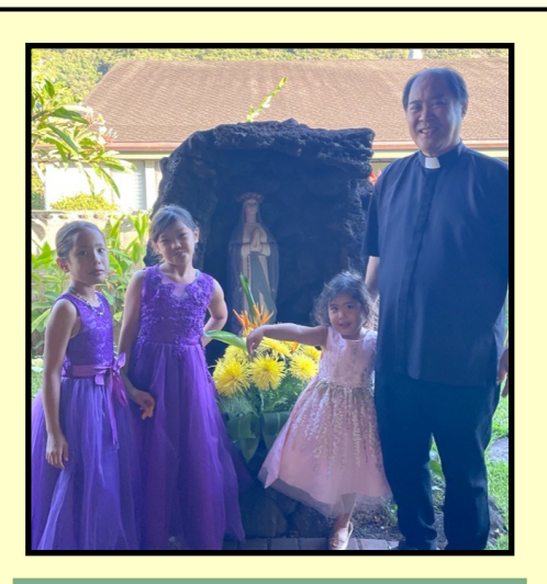
Much Mahalos to an anonymous donor for the new landscaping around the Grotto.