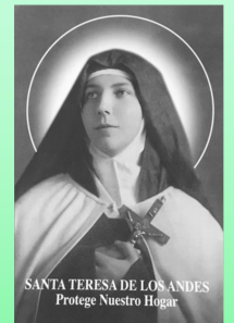
SANTA TERESA DE LOS ANDES Protege Nuestro Hogar

Toward the end of her short life, Saint Teresa of Los Andes began an apostolate of letter-writing, sharing her thoughts on the spiritual life with many people. At age 20 she contracted typhus and quickly took her final vows. She died a short time later, during Holy Week. Known as the "Flower of the Andes," Teresa remains popular with the estimated 100,000 pilgrims who visit her shrine in Los Andes each year. Canonized in 1993 by Pope John Paul II , she is Chile's first saint.